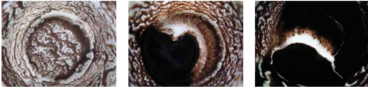
Relative Destinies Detail. 12 permanent pigment prints on somerset paper or gesso, 440 x 420 cm. 2008.