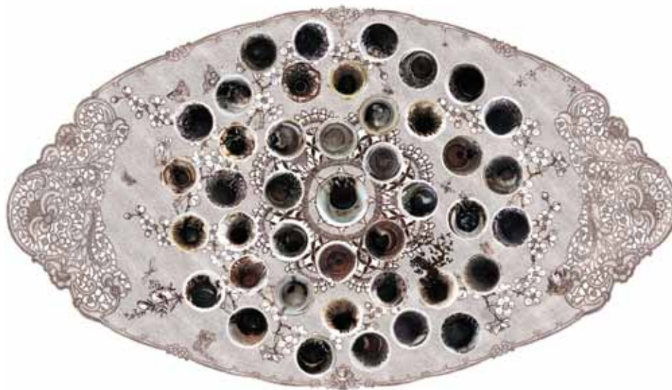
The Eye of Adam Digital collage. Permanent pigment print on somerset paper or gesso, 120 x 65 cm. 2010.

in some overpowering sliver of a way of the sensation of being consumed – by a room, by a time, by a vacuum of existence with no seeming marks or measure of time or end. The scale of the coffee cups, the depth of their patterns, the darkness of their grains, the sensation of an infiniteness to their repetition, gives Chronologie and Relative Destinies different dimension, speaking as much to the very chronology of the unknown as it does to the fragmented narrative of individual destinies in transformation. Reminding us of the solitary stories that form the lattices of life, Baladi offers through this piece a prospect that in many ways frames, supports, and acts as a powerful vista to this body of work. And then doing as she does with all her montages, she fills the gaps by infusing the space, with Fragments . This, Fragments , is a 5-track sound piece written by Baladi, composed by Nathaniel Robin Mann, and edited from fortuneteller Nina's interpretation of the cups, which were themselves re-read through the photographs four months after the six months had met their end. Over thirteen minutes, the story behind the abstract image surfaces are explained, revealing with narrative progression how the family and friends were relating to the approaching death, and to fluxes of loss and hope, faith and despair.