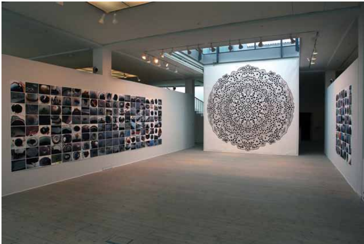
View from The Good Old Days , curated by Clare Butcher, Aarhus Museum, Denmark. 2010.