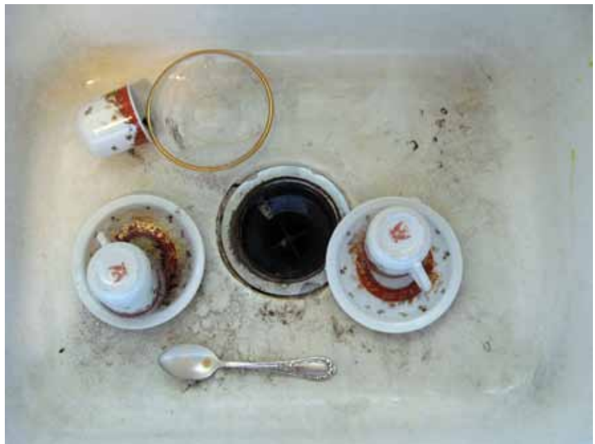
Chronology Detail. 14 permanent pigment prints on somerset or gesso, 980 x 220 cm. 2008.